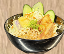
Vegetarian Rice Bowl