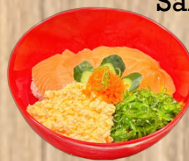
Salmon Sashimi Rice Bowl